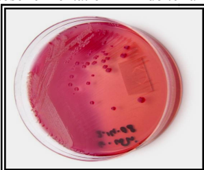
Fig. 2 Rose colonies in agar McConkey typical for E.coli

For Salmonella spp., initially was preceded with the burning of surface organs taken from carcasses with a spatula and then their surface cutting was carried out with scissors in the cube form. The cutting pieces were inoculated in growth and differentiating endo, blood agar and broth terrains and then placed to be incubated in a thermostat at 37 ° C for 18 - 24 hours. After incubation in broth, a diffuse increase was observed: in blood agar was shown small grey shiny colonies, which were of type S; while in differentiating Endo terrain, salmonella colonies were small, smooth and with color of the respective terrain. Agar Mc.Conkey is inhibitory terrain for non enteric microorganisms. Their cultivation in this terrain made possible the differentiation of microorganisms that ferment the lactoze by microorganisms that do not ferment the