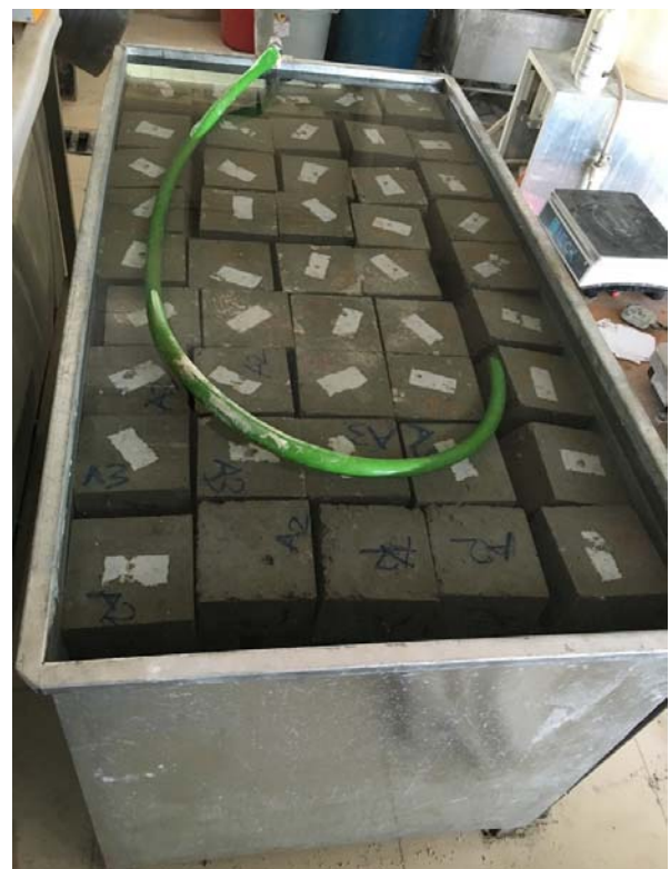
Fig. 4 Curing equipment