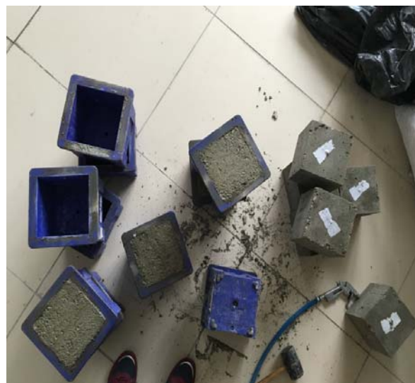
Fig. 6 Cube specimens after abstracting