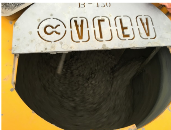
Fig. 2 Mixing process