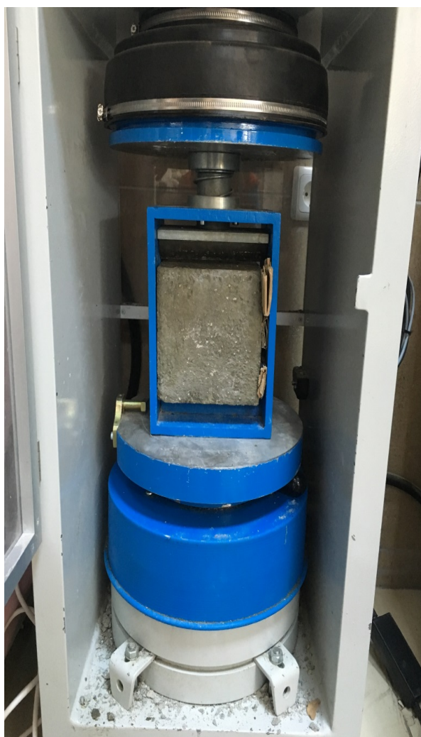
Fig. 5 Compressive strength test equipment

In this study, it is observed that if the dosage of AEAs increases compressive strength of concrete decreases apparently. The main reason of this is that air bubbles occur in the concrete mix. AEAs cost these bubbles. The highest difference in compressive strength between the plain and mixes is 7.6% for mix A6.