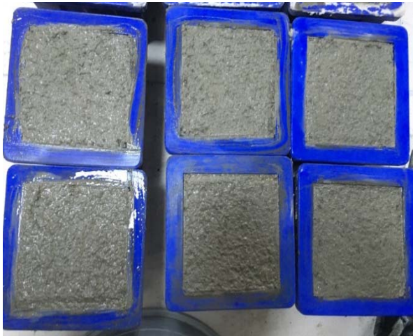
Fig. 1 Cube specimens used for experiment