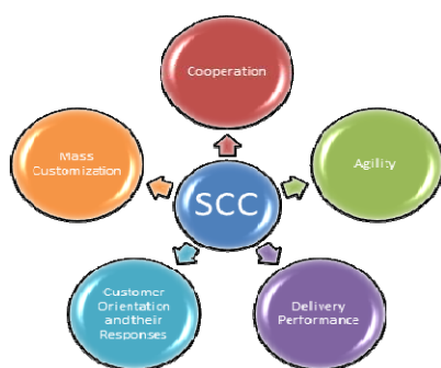
Fig. 3 SCC model based on the strategies

Considering the importance of these strategies, a conceptual model of supply chain competitiveness has been thought of and represented in Fig. 3.