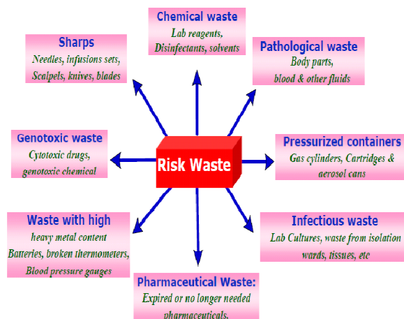
Fig. 2 Categories of hazardous medical waste [15]

According to [16], [17], and [15] health-care waste is classified as Sharp waste (e.g., hypodermic needles, scalpels etc.), Chemical waste (e.g., reagents, solvent etc.), Pathological waste (e.g., human tissues, body parts, fetus, etc.), Infectious waste (e.g., blood and body fluids etc.), Pressurized containers (e.g., gas cylinders, aerosol etc.), Pharmaceutical waste (e.g. out-dated medications, etc.), Genotoxic waste (e.g., cytotoxic drugs and genotoxic chemical) and Waste with high heavy metal content (e.g., batteries, thermometers etc.) (See Fig. 2):