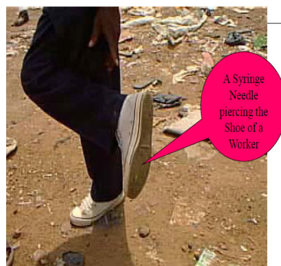
Fig. 3 Risk at a Dump Site in KwaraState Nigeria [20]