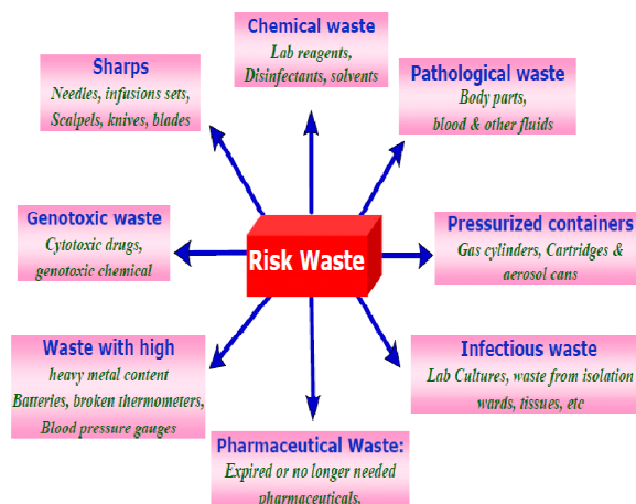
Fig. 2 Categories of hazardous medical waste [15]

According to [16], [17], and [15] health-care waste is classified as Sharp waste (e.g., hypodermic needles, scalpels etc.), Chemical waste (e.g., reagents, solvent etc.), Pathological waste (e.g., human tissues, body parts, fetus, etc.), Infectious waste (e.g., blood and body fluids etc.), Pressurized containers (e.g., gas cylinders, aerosol etc.), Pharmaceutical waste (e.g. out-dated medications, etc.), Genotoxic waste (e.g., cytotoxic drugs and genotoxic chemical) and Waste with high heavy metal content (e.g., batteries, thermometers etc.) (See Fig. 2):