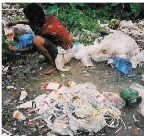
Fig. 5 Medical Waste Scavenging in Bangladesh [15]

In developing countries, additional hazards occur from scavenging at waste disposal sites and the manual sorting of hazardous waste from health-care establishments.