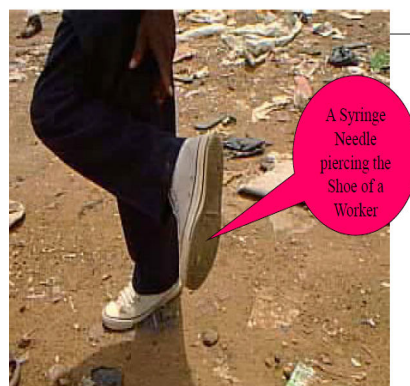
Fig. 3 Risk at a Dump Site in Kwara State Nigeria [20]