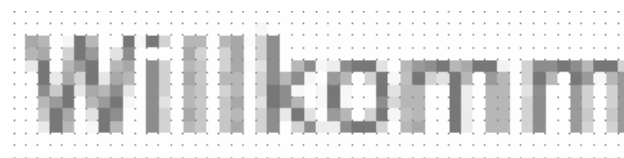
Fig. 1 A Typical extracted word from a web image

The text embedded in web images differs in many ways from the text contained in scanned document images. Firstly, these images have to be of very low resolution (72 dpi = monitor resolution) and most of them have very small point sizes (less than 10 points). Thus, these images are very small and only a few pixels are available for their presentation. A bilevel presentation produces aliasing leading to character shapes with sharp edges, curves and diagonals. In order to overcome this drawback most font rendering engines use a method called anti-aliasing to smooth edges, curves and diagonals by using several color levels hoping to profit from the way our eyes tend to average two adjacent pixels and see one in the middle. Figure 1 demonstrates this fact: