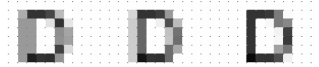
Fig. 3 (a) “Downsampling” with Java

“Downsampling” was performed using two different rendering tools: 1) the library provided by Adobe Photoshop and 2) the method used by the Java library as shown in figure 3.