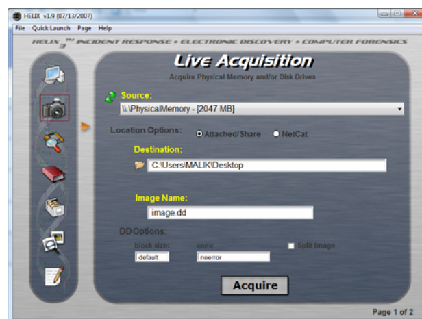
Fig. 1. A screenshot from Helix live CD for capturing memory imagers.

Helix Live CD is a customized version of Knoppix Live Linux CD [3]. This bootable live CD incorporates many tools and one of them is sdd tool (specialized dd tool) which is used to acquire memory image in this experiment. A screenshot of Helix Live CD memory acquisition is shown in Figure 1. A list of tools included in the live CD is shown in Table 1. Organizations that are using Helix live CD as the forensic tool in their Incident Response/Forensics Training are listed in Table 2.