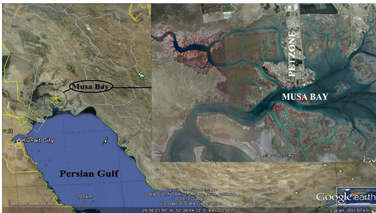
Fig. 1 Persian Gulf and Musa Bay