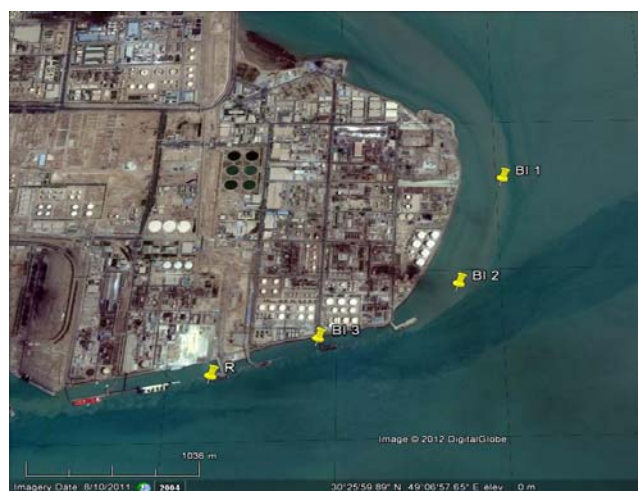
Fig. 2 Study area in Musa Bay

Petrochemical special economic zone is located in the southwestern of Iran and it is composed of 5 sites ( the area is recently been developed and Bandar-e- Imam Khomeini, Razi and Farabi Petrochemical companies has been added to this area). The Wastewater of Bandar-e- Imam Khomeini and Razi Petrochemical companies and the sediments of the coastal area of the selected petrochemical companies (in Musa Bay) were monitored from Feb 2010 to June 2010 (Fig.2 and 3).