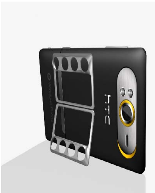
Fig. 5 Shows the use of flips as a mobile stand

The provided flips for grip not only provides a better handling but also to be used as a stand for making the mobile sit in front of the user. See the following image for better understanding.