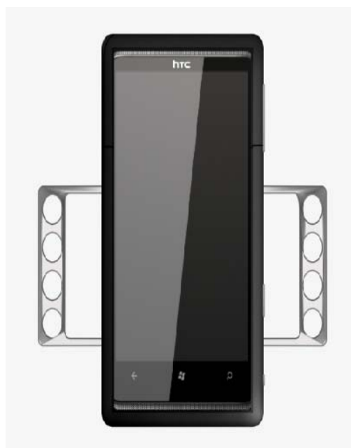
Fig 3 Shows a vertical position of mobile with flips on both sides for better grip on the mobile

The provided solution for this task was to remodel some of the extra features of the mobile. Though being slim is a good feature but at the same time its hard to handle a mobile. Following images shows the new remodelled flips for the mobile for better grip and handling.