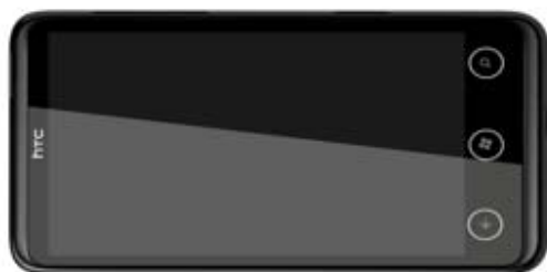
Fig. 2 Shows the solution to the problem. All buttons have a proper boundary defined and shows a circular region around every button