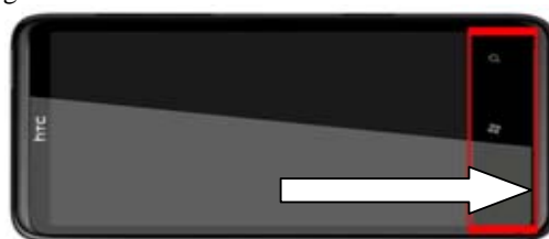
Fig. 1 The white arrow shows the area unintentionally touched by the users while scrolling the pictures

Use the mobile's picture browser to look through 15 different pictures. First perform a left to right scroll , mean see all the pictures by scrolling the screen in horizontal position from left to right. Once all pictures are viewed then scroll from right to left.