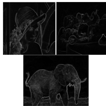
Fig. 9 Experimental results 3 (( A \oplus B ) - ( A \ominus B ))