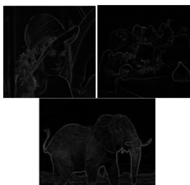
Fig. 8 Experimental results 2 (( A \oplus B ) - A)