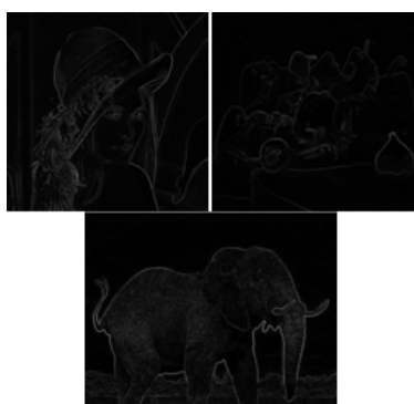
Fig. 7 Experimental results 1. ( A - (A \ominus B) )