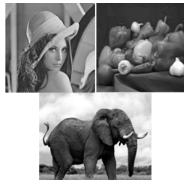
Fig. 3 Gray scale images of original ones