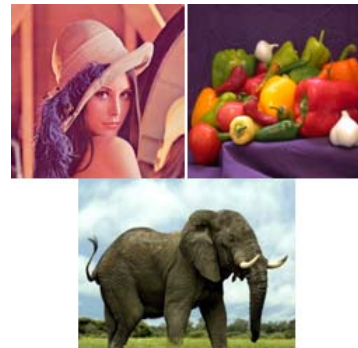
Fig. 2 Sample colored digital images