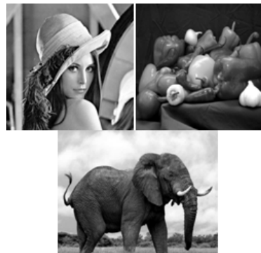
Fig. 4 Contrast enhanced images