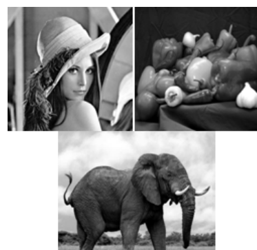
Fig. 4 Contrast enhanced images