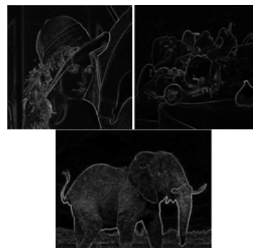
Fig. 9 Experimental results 3 ((A ⊕ B) - (A ⊖ B))