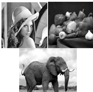
Fig. 5 Dilated images