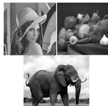
Fig. 3 Gray scale images of original ones