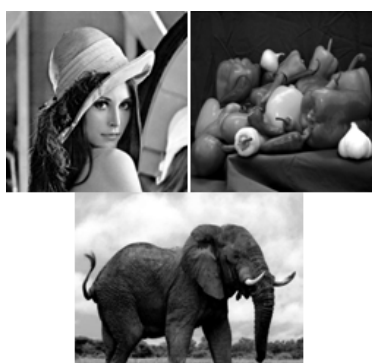
Fig. 6 Eroded images