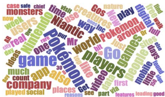
Fig. 2 Word cloud generated from the text of 10 media articles [38]

In reality, it is neither the plot of the game, nor as much the technology that generated ardent discussions worldwide among users, experts, analysts, media, scholars, teachers, parents and basically everyone old enough to process information – it is the adoption rate and scope of Pokémon GO that practically infiltrated all aspects of the global physical and digital society, just the way it merged real and virtual worlds [39]. What's even more astounding to marketers is that they witnessed that phenomenon proliferate without any great marketing efforts (or so they thought). First, Ad Age expressed its confusion about the lack of notable branded marketing in early July and tried to attribute the success of the game to word of mouth and familiar brand name , otherwise seeing it as “ won out-of-nowhere ” [40]. By mid-July, marketers were convinced that “ while it feels as if it appeared from nowhere, Pokémon GO is painstakingly assembled from what came before it: An overnight success 20 years in the making ” [41]. Then, finally, starting at the end of July, until now marketing experts have started tapping into definitions like first real viral success of augmented and virtual reality