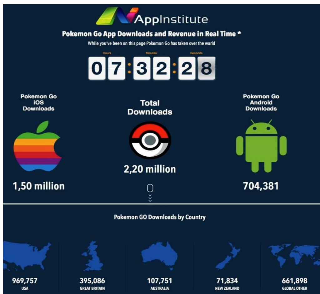
Fig. 3 Real Time Statistics form the App Institute website presenting the number of Pokémon GO downloads worldwide for 7 hours, 32 minutes, 28 seconds on Oct. 14, 2016 [55]

of the game, bringing even national and international politics in [51]. Continuity is presented by the development of complementing technology such as Pokémon GO Plus or the Pokedrone and is yet to be seen in an allegedly discussed screenplay [52]. The principles of immersion , extractability and performance are evident from the real-time statistics (Fig. 3), fan fiction, created daily in blogs (e.g. Pokémon Fans), hack apps (e.g. PokeMesh, PokeWhere), and YouTube channels with millions of subscribers, and billions of views [53]. In addition, there are numerous virtual events that turn into physical fan gatherings of thousands of Pokémon GO players [54].