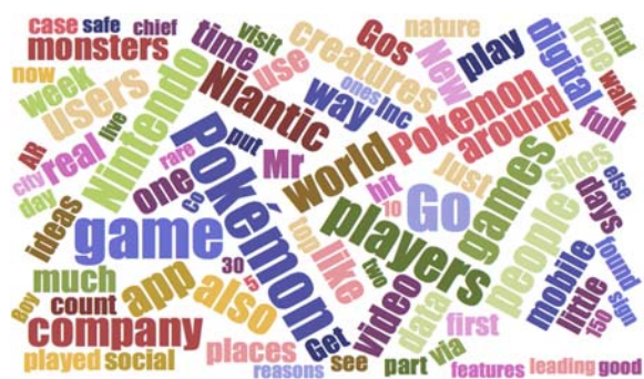
Fig. 2 Word cloud generated from the text of 10 media articles [38]

In reality, it is neither the plot of the game, nor as much the technology that generated ardent discussions worldwide among users, experts, analysts, media, scholars, teachers, parents and basically everyone old enough to process information – it is the adoption rate and scope of Pokémon GO that practically infiltrated all aspects of the global physical and digital society, just the way it merged real and virtual worlds [39]. What's even more astounding to marketers is that they witnessed that phenomenon proliferate without any great marketing efforts (or so they thought). First, Ad Age expressed its confusion about the lack of notable branded marketing in early July and tried to attribute the success of the game to word of mouth and familiar brand name , otherwise seeing it as “ won out-of-nowhere ” [40]. By mid-July, marketers were convinced that “ while it feels as if it appeared from nowhere, Pokémon GO is painstakingly assembled from what came before it: An overnight success 20 years in the making ” [41]. Then, finally, starting at the end of July, until now marketing experts have started tapping into definitions like first real viral success of augmented and virtual reality