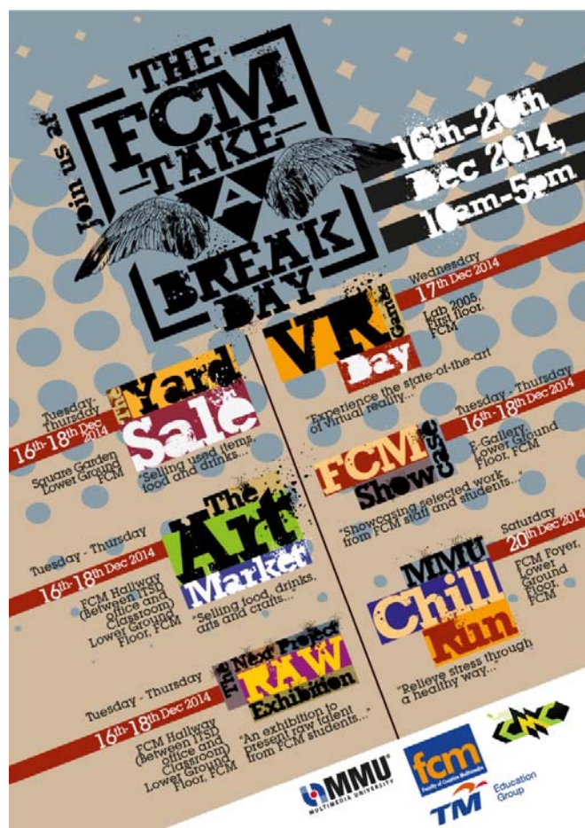
Fig. 3 FCM Take A Break poster

Overall the students managed to overcome all the challenges in managing the FCM take a break week. Based on the overall overview from the lecturers the students had done a good job in making sure that the event follow it schedule and works accordingly. The students reports on their overall performance and they learnt a lot in term of communication skills and marketing skills. Knowledge transfer and sharing happened during the event when they need to communicate with different authority in MMU and Cyberjaya society.