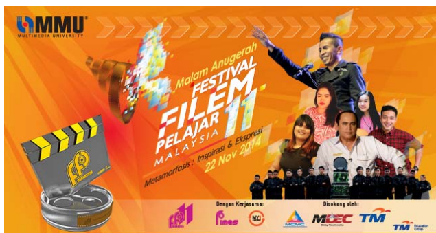
Fig. 2 Student Film Festival (FFM '11) poster

The students enjoyed themselves organizing and managing the events as well as to participate in the festival itself. It gives them an extraordinary exposure to deal with people from all the universities, colleges, community colleges from all around Malaysia. It gives them a new horizon on how other students from other university works in term of developing and implementing creative ideas in multimedia creative environment. The sharing and transferring of knowledge happened in a very conducive environment for teaching and learning of students from higher learning institute like Multimedia University.