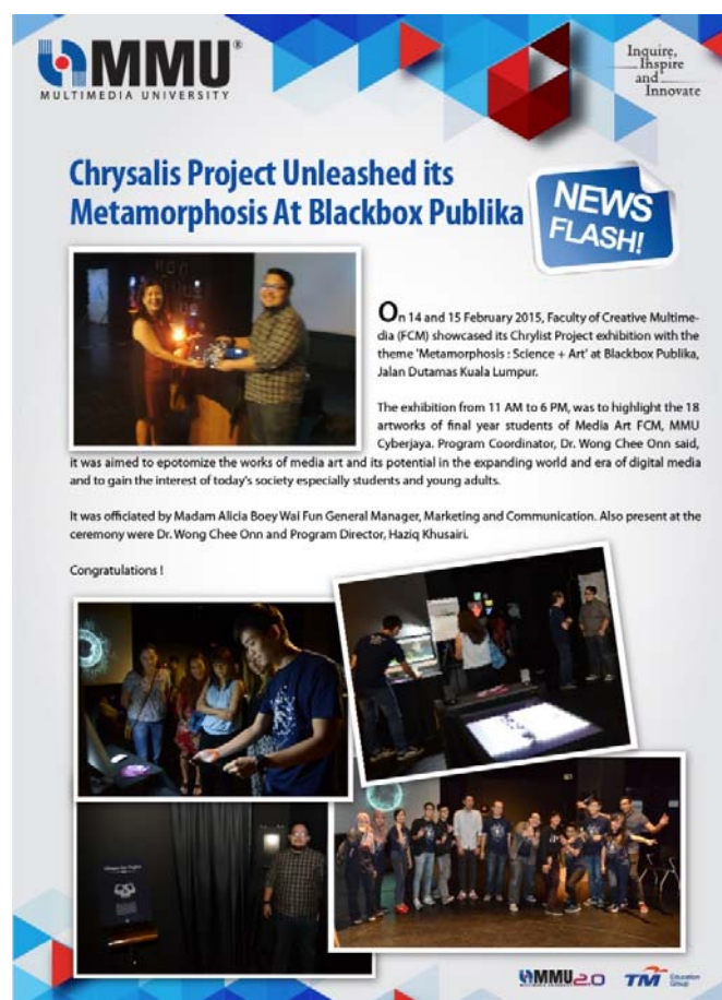
Fig. 4 New on Media Art Exhibition

Fig. 4 shows the media art showcase as one of the event runs by project management students. This event showcases the final year students' project for Media Art students. The students from project management class in Media art specialization were assigned to handle the showcase from planning, invitation, facilities and the overall running of the event. The event was held at Blackbox, Publika and the rental was sponsored by MMU. The students were exposed to task like setting the site for the showcase where they have to decide what facilities needed for each of the project showcasing at Blackbox, Publika at Damansara, Kuala Lumpur, Malaysia.