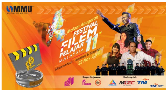
Fig. 2 Student Film Festival (FFM '11) poster

The students enjoyed themselves organizing and managing the events as well as to participate in the festival itself. It gives them an extraordinary exposure to deal with people from all the universities, colleges, community colleges from all around Malaysia. It gives them a new horizon on how other students from other university works in term of developing and implementing creative ideas in multimedia creative environment. The sharing and transferring of knowledge happened in a very conducive environment for teaching and learning of students from higher learning institute like Multimedia University.