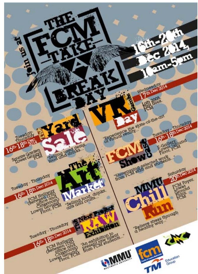
Fig. 3 FCM Take A Break poster

Overall the students managed to overcome all the challenges in managing the FCM take a break week. Based on the overall overview from the lecturers the students had done a good job in making sure that the event follow it schedule and works accordingly. The students reports on their overall performance and they learnt a lot in term of communication skills and marketing skills. Knowledge transfer and sharing happened during the event when they need to communicate with different authority in MMU and Cyberjaya society.