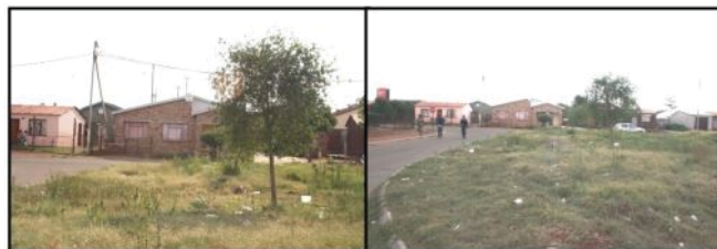
Fig. 2 Site before commencement of the research

Entrance to the community in this case study was gained through a Ward Committee member of Ward 6. In South Africa, wards are geopolitical subdivisions within a municipality (governing body of a town/city) that plays a crucial role in governing and managing local society [43]. The role of the Ward Committee is to improve the level of democratic public participation within the jurisdiction of a local government [44]. Ward Committee members are democratically elected by citizens as representatives of the people living in the specific ward. In this case the community was contacted with the assistance of the Ward Councillor (head of the Ward Committee and one of the Municipal Councillors). An open invitation was given to community members to attend an initial on-site focus group to discuss the transformation of the open space appointed for revitalisation (Fig. 2 – Site before commencement of the research).