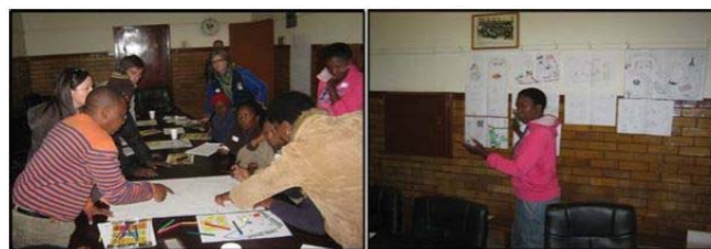
Fig. 5 Collaborative Design Workshop

Phase three: Collaborative design workshop. According to [58] a collaborative design workshop can only be successful when interactive teamwork is followed. Interactive teamwork is firstly based on proactive collaboration where a better outcome is achieved by the group, compared to what is possible by individual effort [59]. Before commencement of the workshop community members (core participants) were requested to develop spatial ideas on how they would see the space being transformed. Using visual data in this case serves as a way for community members to express themselves in other ways than verbal expressions. The individual drawings served as a point of departure for the workshop. From the individual ideas, collective design elements were selected as guidelines to inform the concept plan/design. During the second stage of the workshop a communal plan was negotiated and developed in a collective manner (Fig. 5). The workshop laid the foundation for further involvement of stakeholders such as the local municipality, academic researchers and other community members. From here various plans and designs were negotiated until a final plan/design was agreed upon (Fig. 6).