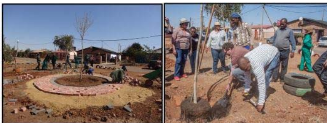
Fig. 7 During implementation