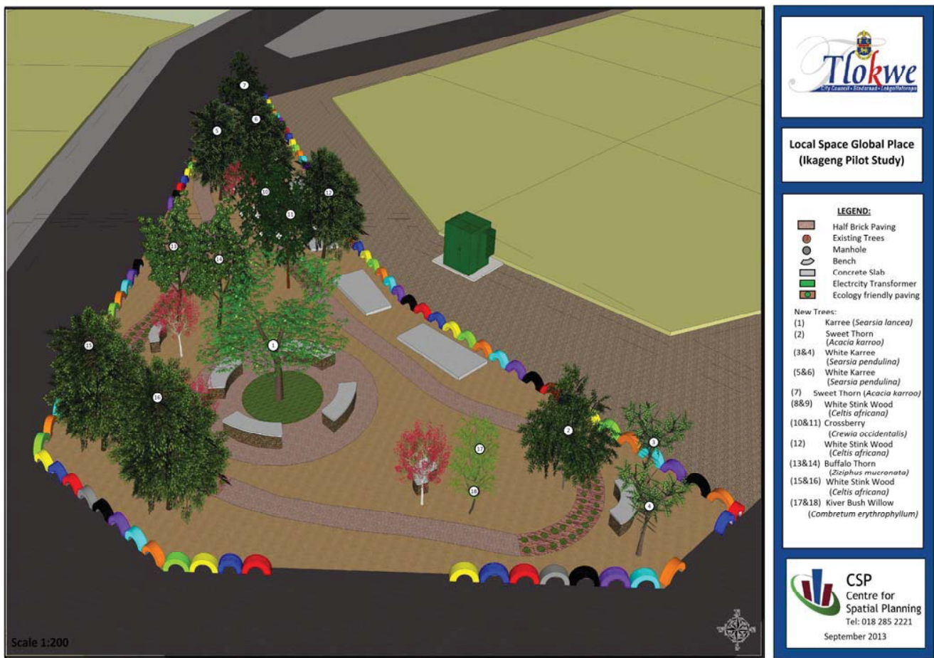
Fig. 6 Final design