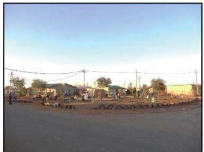
Fig. 8 The site after starting to implement the plan/design