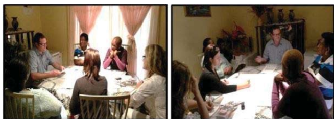
Fig. 9 Reflective focus group