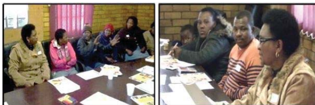
Fig. 4 Second focus group

Phase two: Second focus group. From the first focus group, a second core focus group was selected consisting of eleven participants between the ages of twenty-five and sixty and based on the following criteria (i) daily interaction with the site , (ii) living adjacent to the site , (iii) have been living close to the site for longer than five years and (iv) being able to express themselves verbally in English .