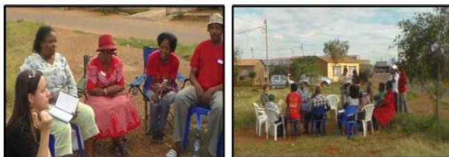
Fig. 3 On-site focus group 1

Phase one: First focus group. The aim of this focus group was to gain a holistic understanding of how the research setting was experienced by the community (Fig. 3). The focus group consisted of twenty participants whose ages vary between twenty-five and sixty. This larger group was divided into two smaller focus groups led by two facilitators, an urban planner and an urban ecologist, both team members of the LSGP project. Questions posted to initiate further discussion included: (i) how do you experience this site and surrounding area , (ii) how do you envision this site in the future , and (iii) based on the first and second question, how would you like to see the way forward?