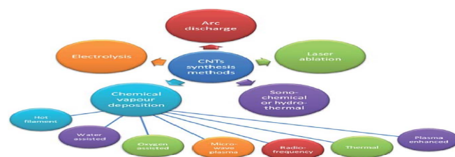
Fig. 2 Currently used methods for CNTs synthesis