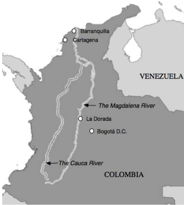
Fig. 1 The Magdalena River

This paper is divided into four major sections, briefly an overview of the Magdalena's river situation and the river's investment project, followed by description of the methods used, the research results, recommendations and finally conclusions.