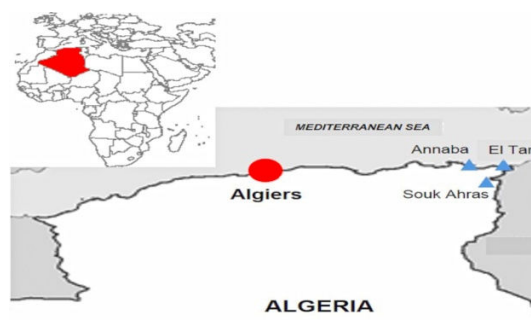
Fig. 1 Geographical locations of the study areas

The research survey was conducted for six months from January to June, 2014, in cities and villages of the three districts: Souk Ahras, Annaba, and El-Tarf located in north-eastern Algeria (Fig. 1). The Annaba region is a coastal town situated in the central part of north eastern Algeria 533 km from Algiers. The El-Tarf region bordering the city of Annaba is located 589 km from Algiers. The area of Souk Ahras is located in the far eastern part of Algeria, near the Tunisian border, and 554 km from Algiers.