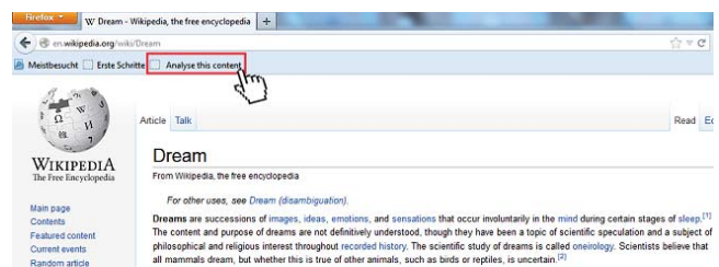
Fig. 2 Selection of Web Content to be Analysed

DocAnalyser [14] is a new web service that offers a novel way to interactively search for similar and related web documents and to track topics without the need to enter queries manually. The user just needs to provide a web content using the DocAnalyser's bookmarklet (downloadable JavaScript code in a web browser bookmark to send the selected web content to the DocAnalyser web service) to be analysed. This is usually the web page (or a selected part of it) currently viewed in the web browser (see Fig. 2).