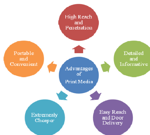
Fig. 1 Several Advantages of Print Media