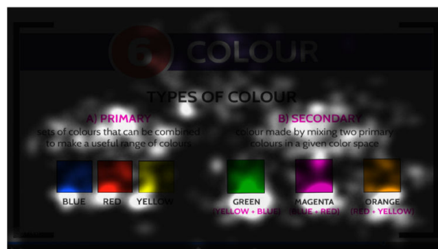
Fig. 3 Focus map of a participant's gaze pattern