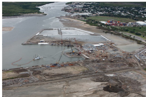
Fig. 3 Small size CSD dredging TMP mooring -2011

Though it has long straight geometry, Ross River channel has a shallow depth of 3 m that not accessible by the large size TSHD 'Brisbane', thus only accessible by small size TSHD. As there is no small size TSHD available in the eastern coast of Australia, the Port of Townsville hires services of small size cutter suction dredge (CSD) on as required basis for Ross River and Townsville Marine Precinct mooring area dredging. The maintenance dredging material derived from Ross River area is pumped into containment ponds at port's eastern reclamation area through submerged, floating and land base pipe line. In addition to the grab dredge, TSHD, and small size CSD vessels, the port regularly uses drag beam 'bed leveller' to agitate silt build-up and drag silt into storage areas as well as removal of high spots that left by the TSHD.