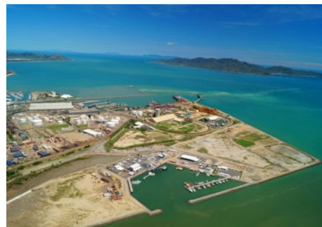
Fig. 5 Port of Townsville Eastern Reclamation Area -2014

Townsville's infrastructure ,Townsville Marine Precinct and the sea channel section of Ross River.