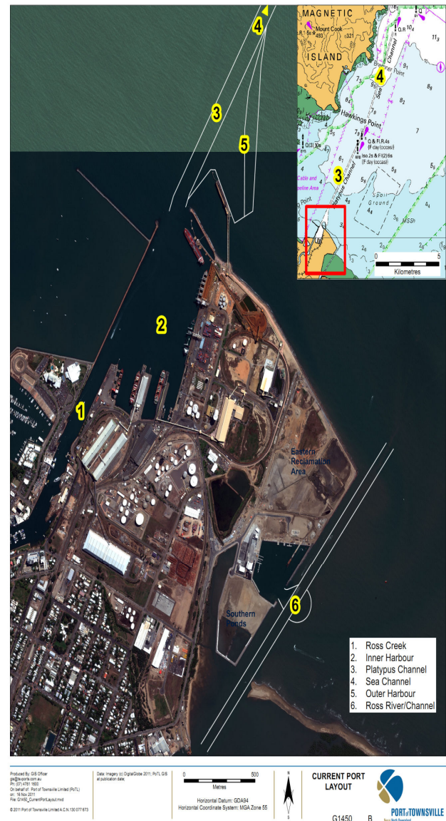
Fig. 2 Port of Townsville maintenance dredging locations

The Port of Townsville uses various types of dredging vessels for its maintenance dredging operations. Efficiency is a determining factor in selecting the dredging vessel that best suit each of the port's six maintenance dredging locations. However, the efficiency of a dredge vessel is largely influenced by the configuration of the port area to be dredged (geometry and depth), the dredged material transport and placement requirements as well as sediment contamination condition.