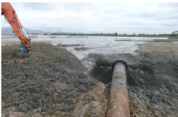
Fig. 4 Dredged material placement into port's ERA - 2011

One of the predominant aims of the 1996 Protocol is to have less and cleaner waste disposed at sea. This aim falls in line with Port of Townsville's strategy of reduction of the amount of dredge material to be disposed at sea and maximizing land reclamation alternative [5]. The current port's land based maintenance dredging material disposal is regulated by Queensland Environmental Protection Agency (EPA). EPA issues permit that outlines the maintenance dredging locations, depths, dredge plant to be utilised, quantities of material to be dredged and disposal locations. The option to have dredge material pumped ashore for land reclamation is created by the lack of land to satisfy the port infrastructure requirements and the need to handle contaminated dredged materials.