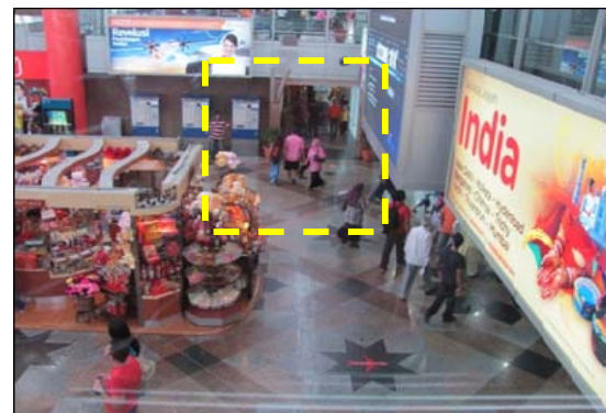
Fig. 2 Overview of the selected area for video recording [12]

The transfer station also has special characteristics to be considered for crowd modelling and simulation such as differences in activities, time pressure and movement patterns [13]. In this research, the focus area was on the exit door (and its surroundings) located at the crowded interchange connecting the public transportation system including trains, buses and taxis within the transportation hub. An overview of the selected location is shown in Fig. 2 where there is a ticket machine, a stall and a shop located at the exit door area (highlighted area). The exit door was selected for the research since the area can supply considerable human movement and behaviour in a crowded area.