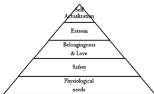
Fig. 1 Maslow model

one's own behavior and feelings, having a freedom of choice, living without inhibitions, being creative and spontaneous, and growing continually by striving to maximize one's potential" [4], [18].