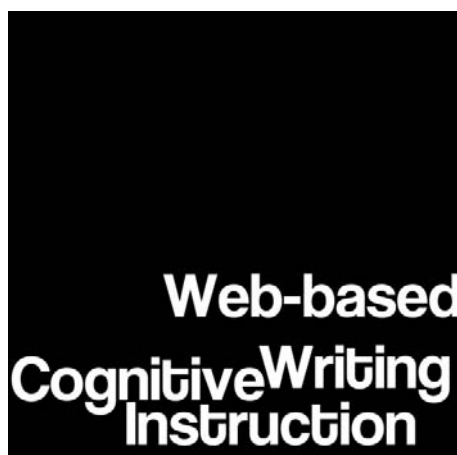
Fig. 1 The official logo of Web-based Cognitive Writing Instruction (WeCWI)

environment can produce learning on par with that of traditional courses, however students can have much more control over their own learning with online instruction.” In addition, [13] also highlights that “e-Learning can be a great fit for all types of learners if you go about it in the right way.” WeCWI advocates the use of one of the most versatile Web 2.0 applications, blog, as an instructional tool together with the highly resourceful Web widgets and hypertext. With the use of the Internet, WeCWI encourages the educators to equip themselves with the knowledge and skills of using the blog to engage their learners towards language and cognitive developments, which can be fostered within a community of inquiry via CMC.