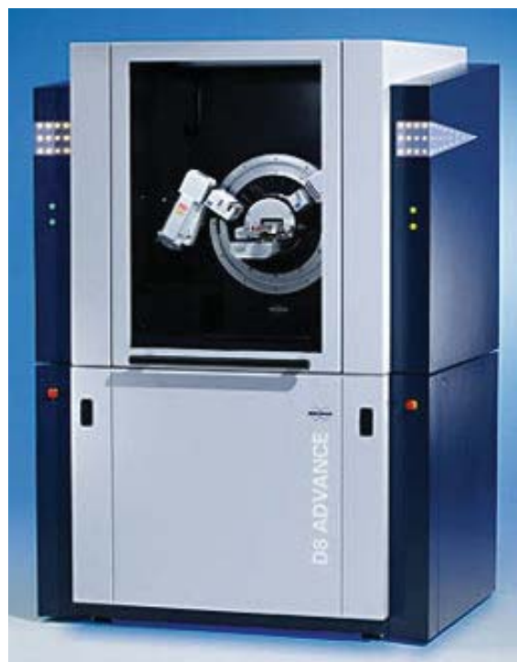
Fig. 2 Apparatus Bruker D8 Advance [15]

Strip of Pt was used for measurement. XRD investigation was done with the sample in air.