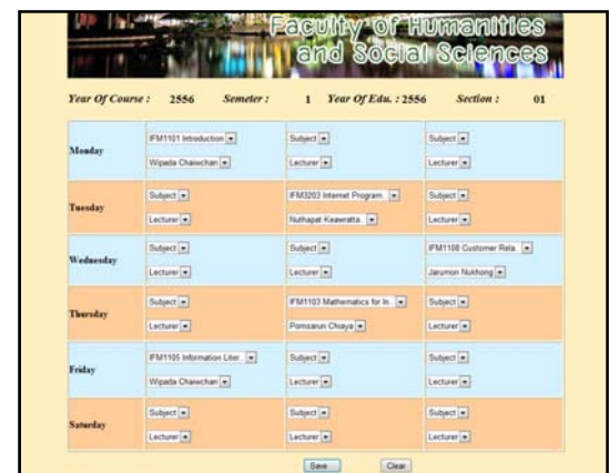
Fig. 4 Timetable management system Users are instructor can set and manage timetable by themselves