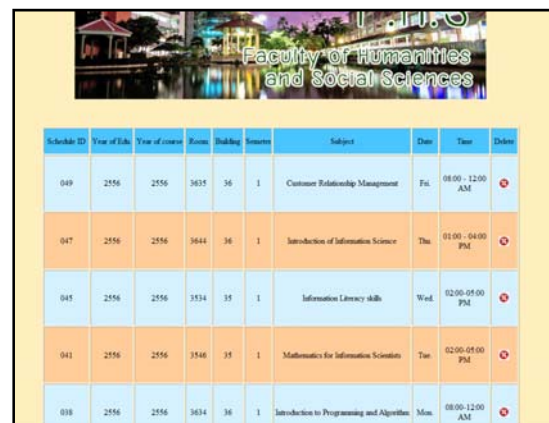
Fig. 5 Timetable Management Result System to Process Timetable from Users (Managed and Display Results)