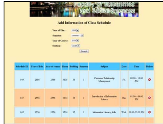
Fig. 3 Timetable Management System Details of the Timetable by Selecting the Data to Match with User Requirements