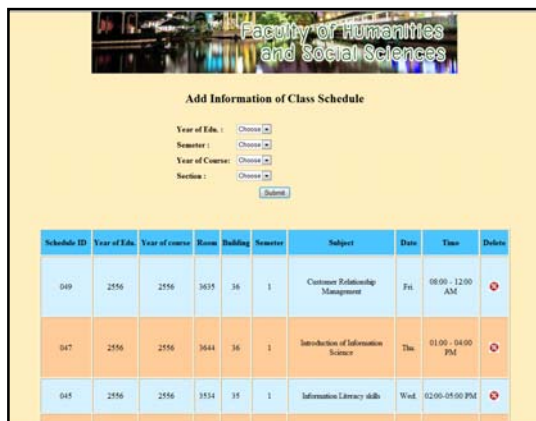
Fig. 2 Timetable Management System Details of the timetable by selecting the data to match with user requirements

The development of the online class scheduling management system by Webbased Application develops program using PHP language and database system using MySQL in the working process of the application of this system can provide several instructors to schedule simultaneously. Therefore, instructors can manage timetable by themselves, and check their timetable with searching and students can check and also publish a timetable and download other documents associated with the system immediately online. To fix the timetable, it is complicated and must be considered several factors depending on conditions and the number of courses. This also depends on the physical characteristics of each class. It will be much easier to change from manual to online one. New technology allows all users to save more time and ease their lives.