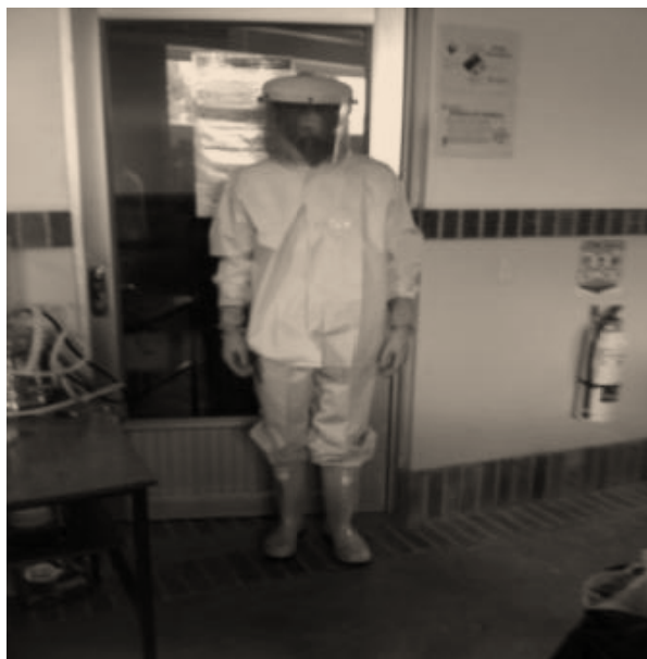
Fig. 2 Personal Protective Equipment