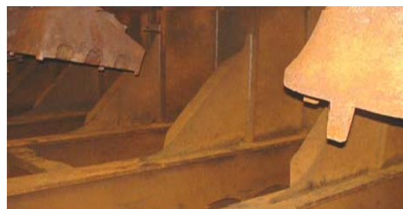
Fig. 1 Marine coating degradation showing rust in water ballast tanks [15]