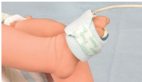
Fig. 8 Foot sensor for neonates [28]