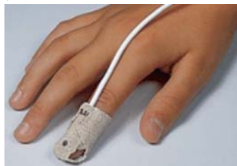
Fig. 9 Fingertip pulse oximeter [29]