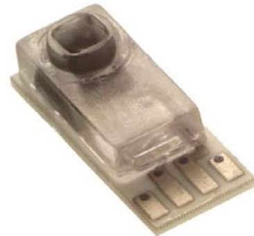
Fig. 5 Commercially available pressure sensor for blood pressure monitors [22]