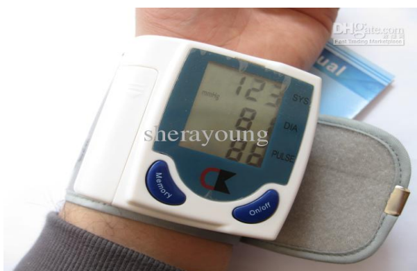
Fig. 2 A digital automatic wrist-cuff blood pressure monitor [8]

The wrist model has a smaller overall dimension and the whole unit has to be wrapped around the wrist. This is a much more space-critical design.