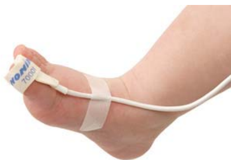
Fig. 7 Toe sensor for neonates [27]

Neonates tend to have movement artifact in their fingers, so choose a toe or foot sensor.