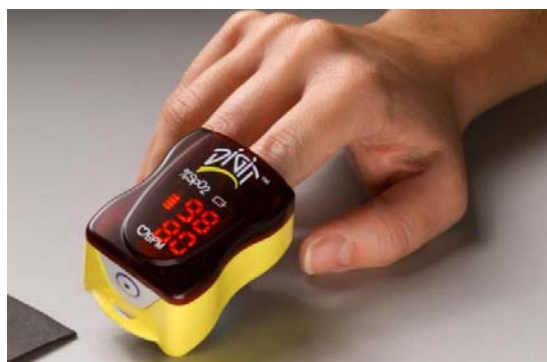
Fig. 6 Pediatric finger sensor [26]

If a finger sensor is too large, it may slip slightly off so that the light source partially covers the finger. This condition, called optical bypass, causes incorrect readings.