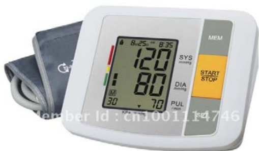
Fig. 1 A digital automatic upper-arm blood pressure monitor [7]

The upper-arm model has a cuff, which has to be placed on the upper arm and connected by a tube to the monitor.