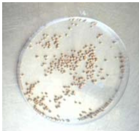
Fig. 2 Biological material