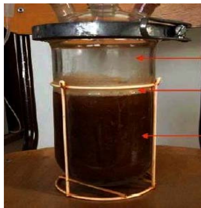
Fig. 3 Bioreactor of fermentation

Saccharomyces cerevisiae is a species of yeast. It is perhaps the most useful yeast, having been instrumental to winemaking, baking, and brewing since ancient times.