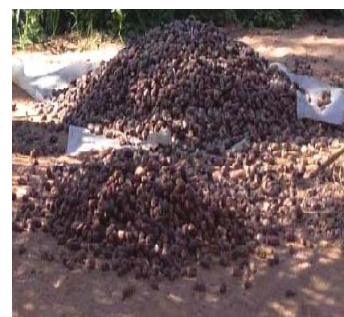
Fig. 1 Vegetable material

The substrate used for the production of alcohol is formed of the waste of dates on certain varieties of common dates.