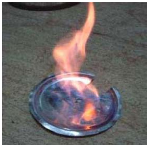
Fig. 5 Ethanol produced in the laboratory

The alcohol produced in the laboratory has the following characteristics: volatile, flammable, clear, with a pungent odor.