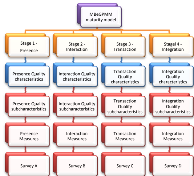
Fig. 2 Components of MBeGPMM

The MBeGPMM is a hierarchical model with 5 levels. The first level is composed of four maturity stages as the following: presence, interaction, transaction and integration. Each maturity stage contains quality characteristics related to the corresponding maturity stage in the second level. Furthermore, each quality characteristic is composed of one or more quality sub characteristics in the third level. Moreover, each quality sub characteristic can be measured using one or more measures that can be in the form of a user survey in the fourth and fifth levels. Fig. 2 shows the components of the proposed MBeGPMM.