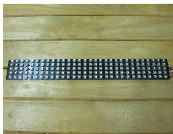
Fig. 5 Experimental set of luminous efficacy of LED tubes

Step 2: To test luminous efficacy and electricity supply