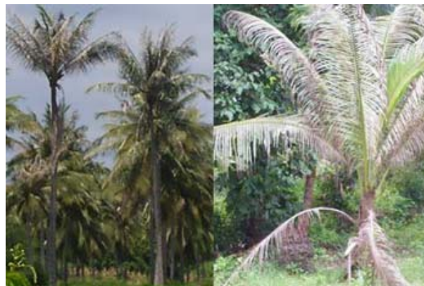
Fig. 1 The damaged coconut plantation by the adult coconut hispine beetle