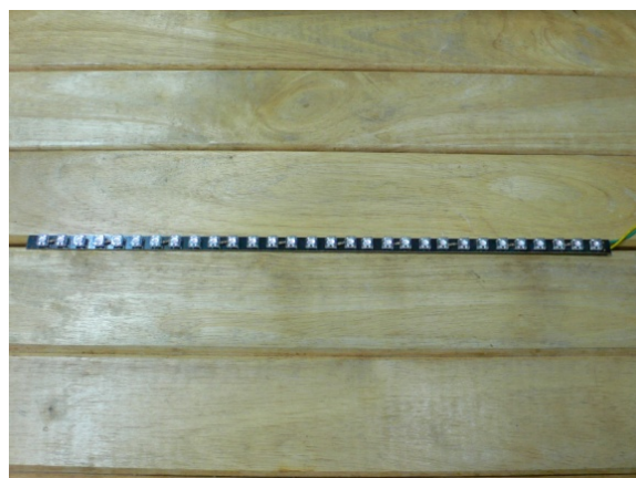
Fig. 4 Thirty sets of forward bias on a LED tube