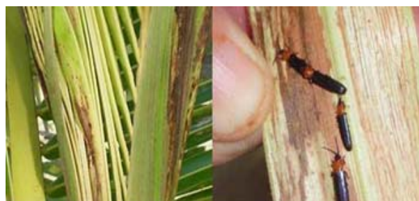
Fig. 2 The adult coconut hispine beetles

The coconut hispine beetle ( Brontispa longissima Gestro), the indigenous pest, which lives in Indonesia, Papua New Guinea, and Malaysia, is one of the most damaging pests for the coconut palms including ornamental palm species in many countries in Asia and the Pacific region. The outbreak of coconut hispine beetle has caused substantial production losses without less product quality; once in the past the coconut palms discolored from green to gray [3]. Adult coconut hispine beetles, around 1 cm long and 2-2.5 mm wide, are flat with yellowish brown thorax and black elytra as shown in Fig. 2. The larvae and the adults feed on leaf tissues of the developing, unopened coconut buds. In the stage of full growth, they become insects of Coleoptera.