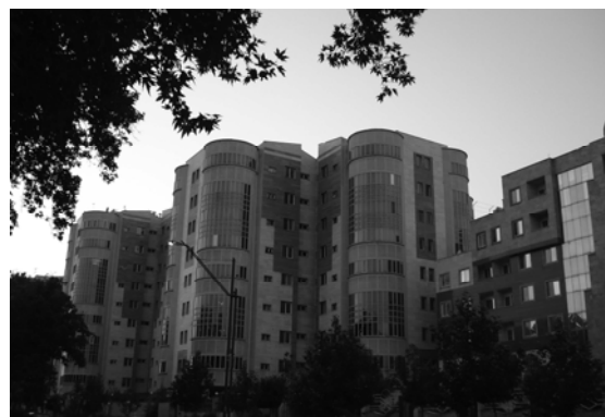
Fig. 4 High rise buildings in Jahanshahr Neighborhood

What is raised as serious warning and concern in Jahanshahr Neighborhood is tolerable capacity of neighborhood. This neighborhood has reached to the threshold of population and construction capacities and has no capacity for physical development (Fig. 4). If continuous monitoring as an important principle is ignored, principles and criteria that have guaranteed the neighborhood sustainability will be eliminated. Due to increasing the population, main streets of neighborhood have a high traffic volume in some day hours, but unfortunately urban management authorities have destroyed the gardens and widened the streets to solve this problem. It caused destruction of resources capacity and natural characteristics of neighborhood.