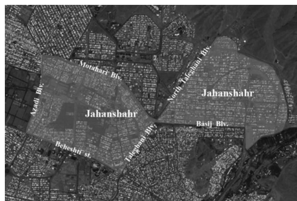
Fig. 2 Location of Jahanshahr neighborhood