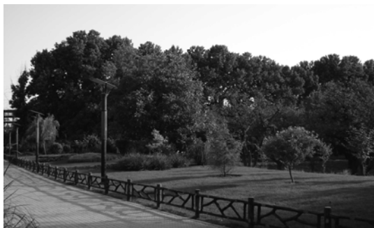
Fig. 5 Fateh Garden as one of the most important landmarks of Jahanshahr Neighborhood