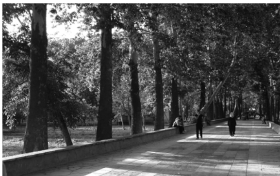
Fig. 3 Walkways of Jahanshahr residents in Fateh Garden