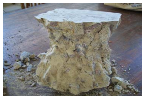
(a) Fractured experimental specimen