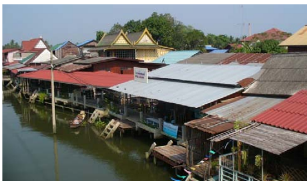
Fig. 3 Examples that were rare to find and showed riverside architectural development