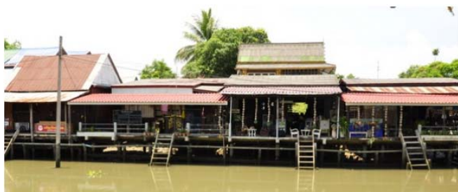
Fig. 4 Community atmosphere, waterfront

The sequent research should study the riverside architectures in each region of Thailand in order to find the architectural identities of each region.