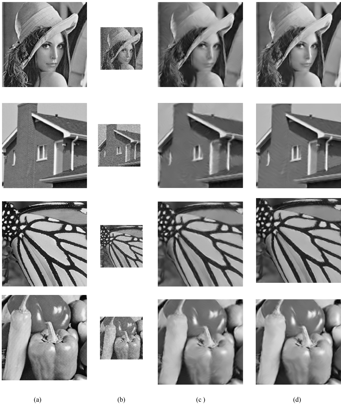
Fig. 2 (a) Original HR image (b) LR noisy image (c) Denoised and interpolated image via LMMSE (d) Denoised and interpolated image by the proposed scheme