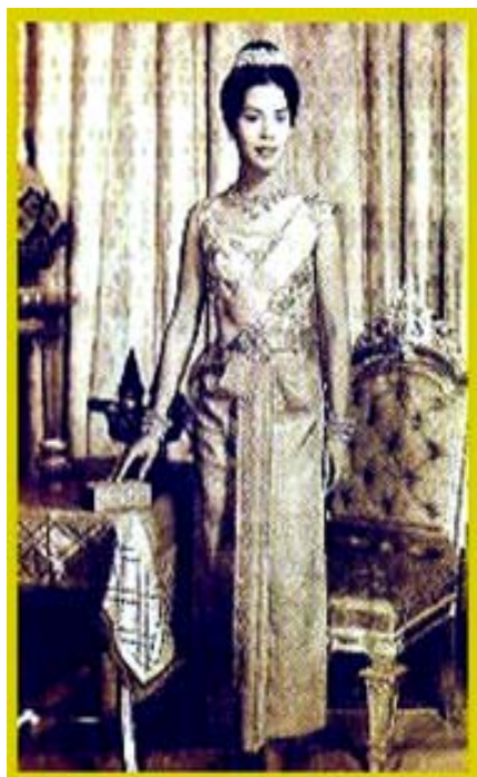
Fig. 21 Queen Sirikit in Thai Dusit dress