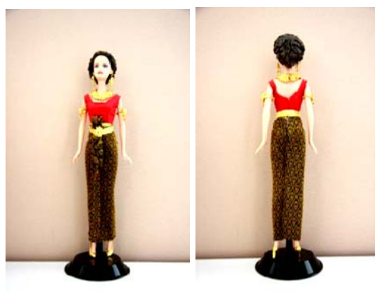
Fig. 22 Thai Dusit dress (front and back)

Formal Thai national costumes for women have been existed since the reign of King Rama IX and they were preferred to be worn in various well-known ceremonies as shown in above history. For Thai traditional costume for men, suits were previously preferred until 1977. In 1977, Her Majesty Queen Sirikit established handicraft project to support products made by local woven fabric of villagers in various regions therefore this type of product was more recognized. However, it was still preferred by people in high class society. [4] Consequently, Her Majesty Queen Sirikit found the ways to make this type of product preferred extensively by general people therefore the royal initial was established to order skillful craftsmen of Fine Arts Department to design Thai costume for Thai men by applying historical costume to be more contemporary and suit with current weather, environment, and convenience upon each occasion and place. As a result, the obtained design was