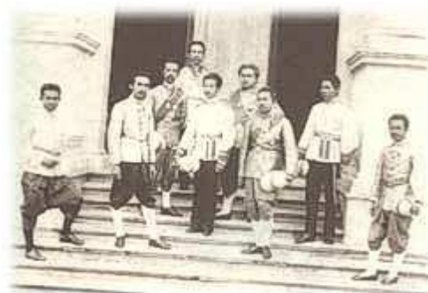
Fig. 3 Uniform in the reign of King Rama IV