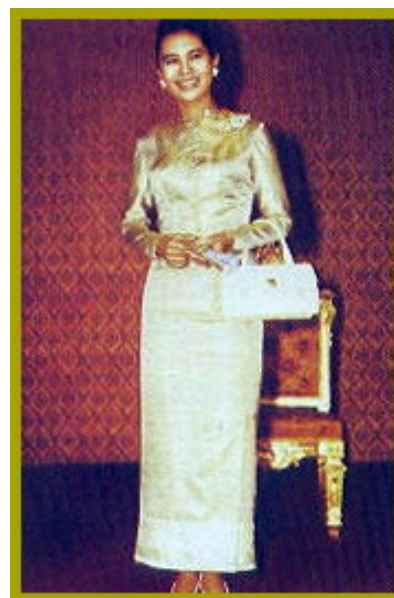
Fig. 11 Queen Sirikit in Thai Amarin dress