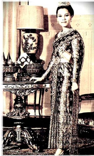
Fig. 15 Queen Sirikit in Thai Siwalai dress