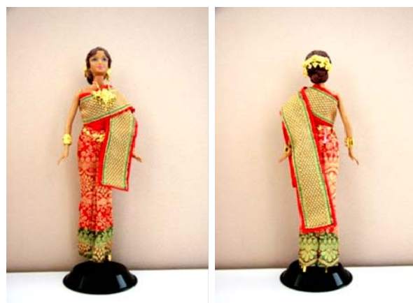
Fig. 20 Thai Chakkraphat dress (front and back)