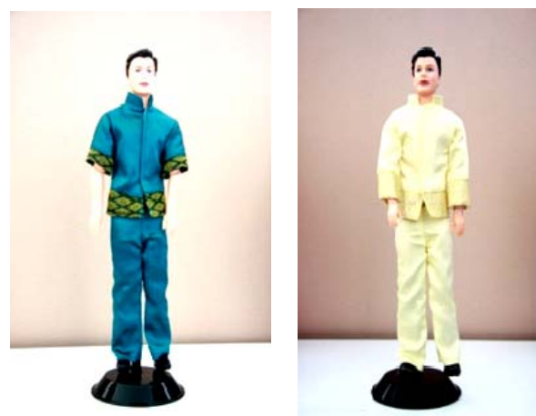
Fig. 24 Formal Thai national costume for men: short sleeve shirts and long sleeve shirts