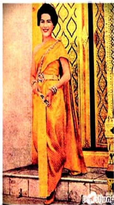
Fig. 17 Queen Sirikit in Thai Chakkri dress