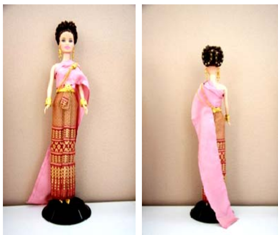
Fig. 18 Thai chakkri dress (front and back)