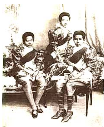
Fig. 5 The costumes Her Majesty the Queen and Princess the reign of King Rama IV

For Thai costume in the reign of King Rama IX (1946 to present), universal design is preferred due to influences from the western. However, people in local areas or countryside remain wearing Thai costume and local costume, i.e., wearing sarong, strip or loincloth. In 1977, Her Majesty Queen Sirikit was established a handicraft project to support products made by local woven fabric of villagers in various regions; therefore, this type of product was more recognized. However, it still preferred by people in high level society. Consequently, Her Majesty Queen Sirikit found the ways to create this product preferred extensively by general people; therefore, the royal initial was established to order skillful craftsmen of Fine Arts Department in many university to design Thai costume for Thai men by applying historical costume to be more contemporary and suit with current weather, environment, and convenience upon each occasion and place. Currently, the important evolution of Thai costume is formal Thai national costume, i.e., formal Thai national costume for women and Thai traditional costume for men, and it is accepted as Thai national costume [2].