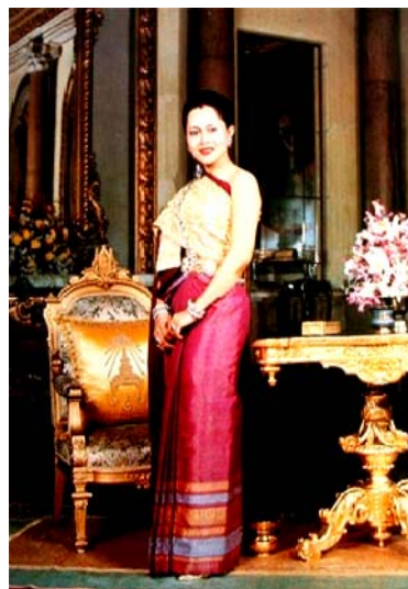
Fig. 19 Queen Sirikit in Thai Chakkraphat dress