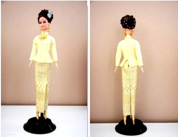
Fig.12 Thai Amarin dress (front and back).