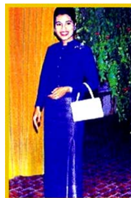
Fig. 9 Queen Sirikit in Thai Chit Lada dress