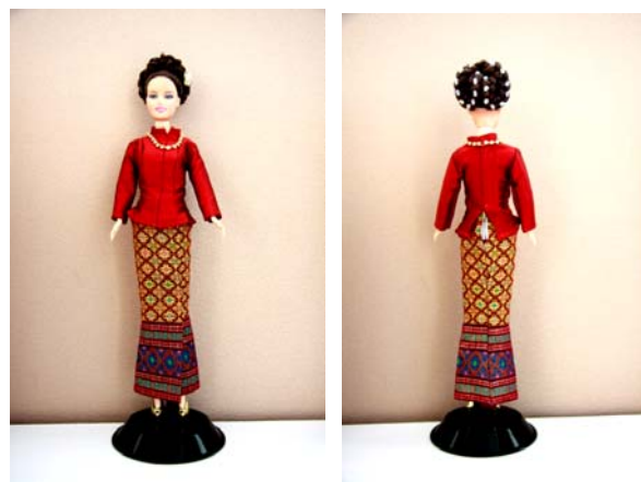
Fig. 10 Thai Chit Lada dress (front and back).