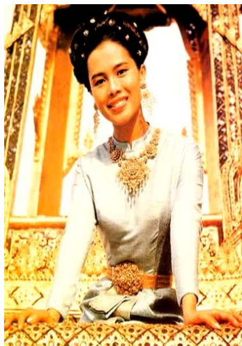
Fig. 13 Queen Sirikit in Thai Boromphiman dress