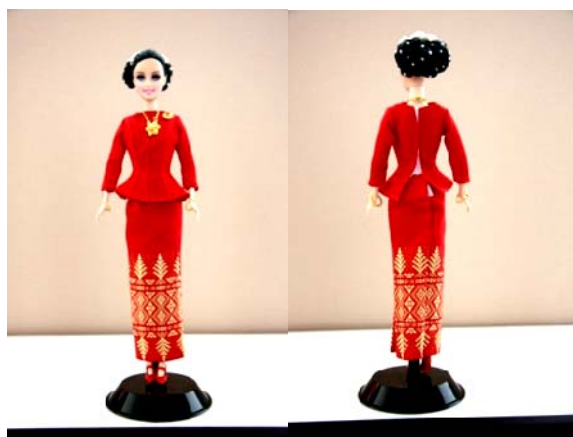
Fig. 8 Thai Rueanton dress (front and back)