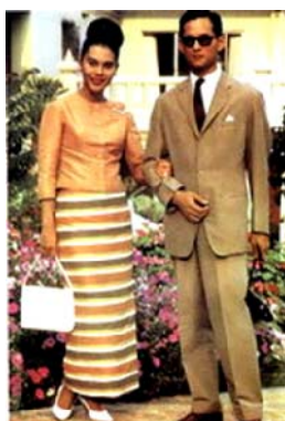
Fig. 7 Queen Sirikit in Thai Rueanton dress