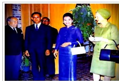
Fig. 6 The visiting of the King and Queen at Europe and America in 1960's

For Thai costume in the reign of King Rama IX (1946 to present), universal design is preferred due to influences from the western. However, people in local areas or countryside remain wearing Thai costume and local costume, i.e., wearing sarong, strip or loincloth. In 1977, Her Majesty Queen Sirikit was established a handicraft project to support products made by local woven fabric of villagers in various regions; therefore, this type of product was more recognized. However, it still preferred by people in high level society. Consequently, Her Majesty Queen Sirikit found the ways to create this product preferred extensively by general people; therefore, the royal initial was established to order skillful craftsmen of Fine Arts Department in many university to design Thai costume for Thai men by applying historical costume to be more contemporary and suit with current weather, environment, and convenience upon each occasion and place. Currently, the important evolution of Thai costume is formal Thai national costume, i.e., formal Thai national costume for women and Thai traditional costume for men, and it is accepted as Thai national costume [2].