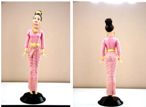
Fig. 14 Thai Boromphiman dress (front and back)