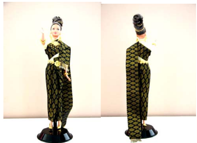
Fig. 16 Thai Siwalai dress (front and back).