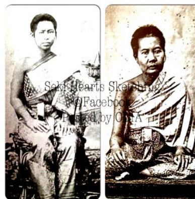
Fig. 1 Women costume in the reign of King Rama I-II