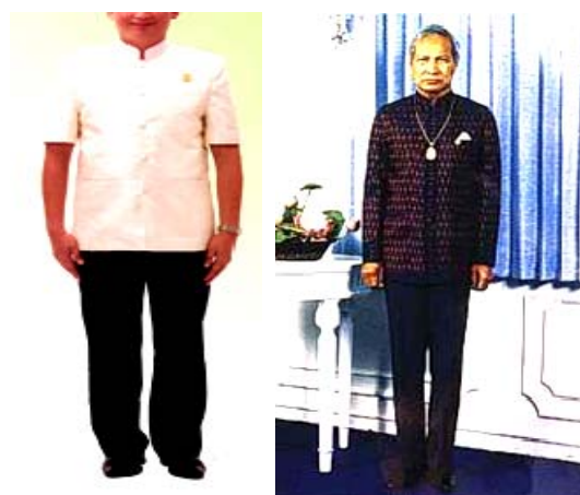
Fig. 23 Formal Thai national costume for men: short-sleeve shirt, long-sleeve shirt

Third design: Shirt with long-sleeves and waist wrapping called "Thai traditional costume" [6].