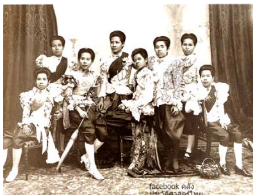
Fig. 4 The costumes Her Majesty the Queen and princess the reign of King Rama IV