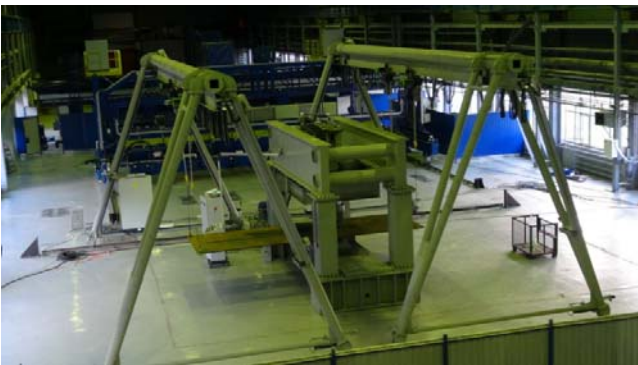
Fig. 6 Bending plate with MGPS-100 machine