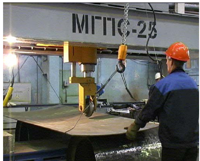
Fig. 4 Bending plate with MGPS-25 machine

Experience, gained by JSC SSTC in designing, manufacturing and operating machines MGPS-25 and MGPS-100 allows starting designing more powerful equipment, and, in the future, introducing automation to roller bending process.