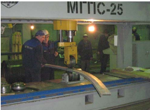
Fig. 5 Bending profile with MGPS-25