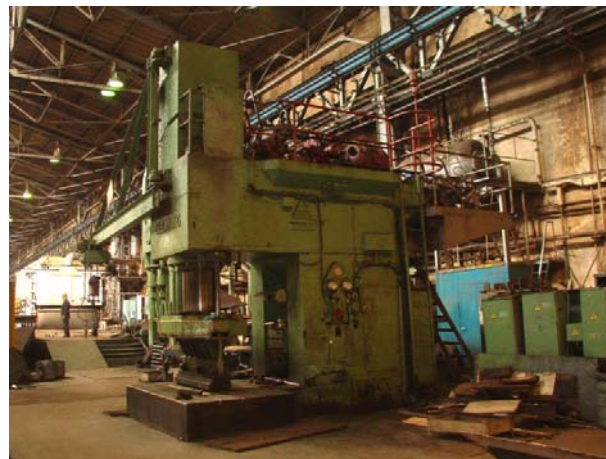
Fig. 1 Press "Clearing", 3500 kN (350t) capacity