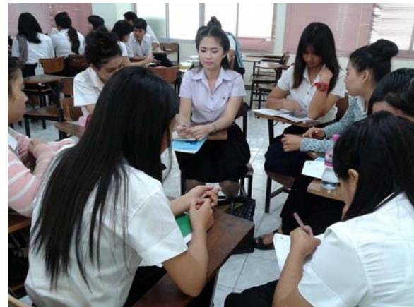
Fig. 2 Students discuss issues of reading

The conclusions of these results found the students had Problems of articulation, illiteracy, local dialects, less interest in the root of exotic language, error in Thai Grammar since childhood, and less practice.