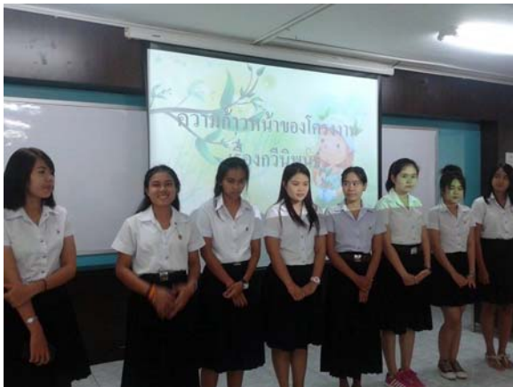
Fig. 1 Groups of students present in class

The conclusions of these results found the students had a lack of proverbs, sayings, similes, figure of speech, and metaphors. Their reading skills were limited when it came to scanning, skimming and detailed reading. When asked to repeat what they read, their interpretation and comprehension was poor. They lacked in knowledge of process of writing and categories of books. They lacked in knowledge of literary works and poems.