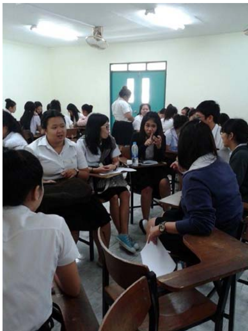
Fig. 4 Students debate issues and summarize

The conclusions of these results found the students had no knowledge of Thai poem pronunciation, no understanding of word meaning, no control of breath, no practice, no affection and faith to poem, no confidence and determination, no optimism to poem, and finally, no knowledge of social context and Thai Culture about the poems.