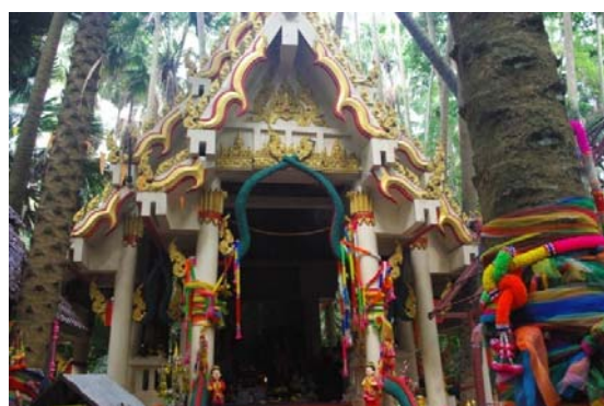
Fig. 3 Grand Srisutto Shrine