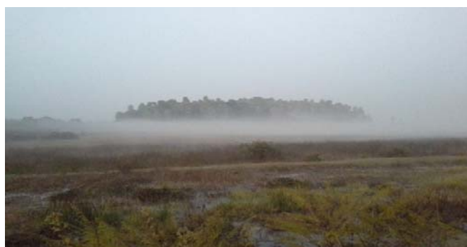
Fig. 1 Kamchanoad Forest Island

For social context, Kamchanoad is full of “Chanoad” (Livistona Saribus) which are the plants similar to palm trees or coconut trees. Chanoad is part of people’s tradition. They believe that Chanoad is sacred tree and won’t be grown anywhere except here. There is a forest called “Kam Chanoad Forest Island” a big group of Chanoad spreading throughout 20 Rais land, located on the edge of 3 villages. It is believed that this forest is the resident of Srisutto Naga. Not only Chanoad, there are many interesting plants growing inside the forest island. [4]