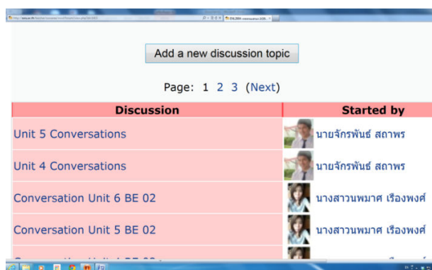
Fig. 2 Discussion web board