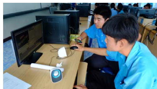
Fig. 7 Participant students learn how to edit video