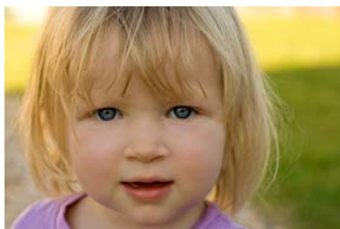
Fig. 3 CU shot