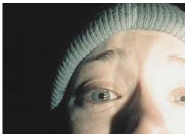
Fig. 2 ECU shot