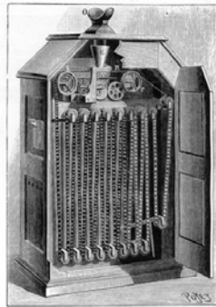
Fig. 1 Kinetograph