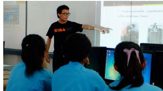
Fig. 5 Students from SISA share basic knowledge and skill in film production to the participant students before on-field activity