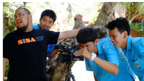
Fig. 6 Students from SISA participate in filming with all of participant students