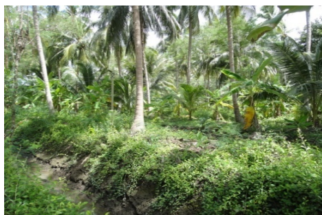
Fig. 4 The coconut orchard