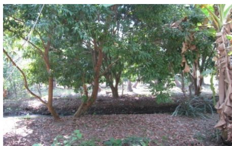
Fig. 2 The lychee orchard