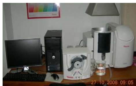
Fig. 5 Atomic Absorption Spectrophotometer Instrument (THERMO series) [9]

60 Sediments sample were collected from 60 orchards. These samples were carried by polythene bag. After collection, some portion of sediment samples was dried in air at 30°C. For heavy metal test, 5 gm of dried sample was digested with nitric acid and prepared 100 ml solution. Finally, four heavy metals (Pb, Cd, Cu, and Zn) concentration were determined by atomic absorption spectrophotometer (AAS), (Fig. 5).