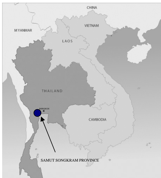
Fig. 1 Map of Thailand [1]