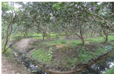
Fig. 3 The pomelo orchard