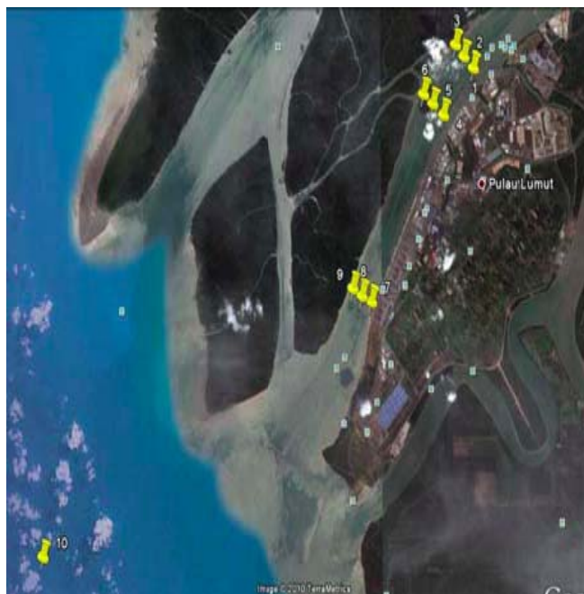
Fig. 1 Location of the sampling stations in West Port Malaysia

Statistical analyses were performed using Microsoft Excel and SPSS 17 software (SPSS, Chicago, IL). Significant difference from each group was evaluated via Kruskal-Wallis one-way nonparametric ANOVA (level of significant is 0.05). Nonparametric correlation method (Kendall's tau-b) was used to obtain the correlation coefficient among physicochemical parameters in water and sediment.