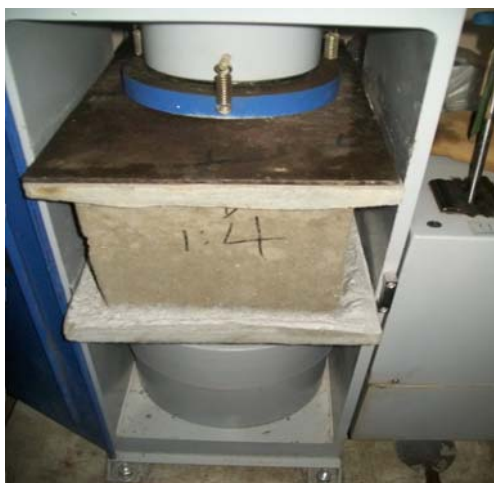
Fig. 1 Sandcrete blocks compressive strength test setup