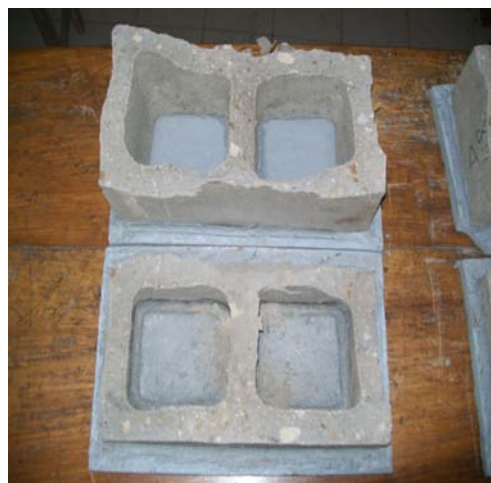
Fig. 3 Fracture shape of sandcrete block specimens