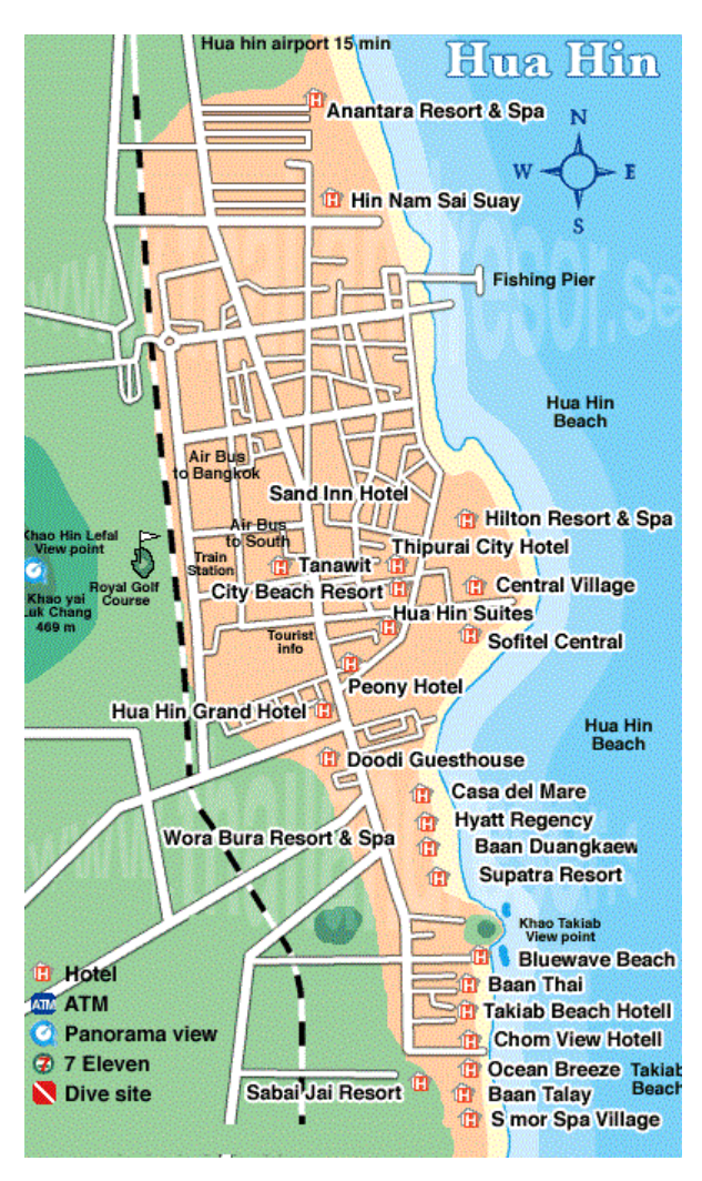
Fig. 1 Hua Hin community and the local nearby areas

Hua Hin, as shown in Fig. 1, the area map of Hua Hin, Prachaup Khiri Khan Province, Thailand is considered an area that has been highly development in the various fields such as tourism and economic of the area's rapid growth.