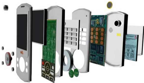
Fig. 2 The example product

The numerical data of the cost parameters can be modeled in a table format as shown in Tables II and III. The table format in Table II can be used for representing the cost parameters related to P_{im} . The table format in Table III can be used for representing the cost parameters related to P_{imj} . The table format in Table IV can be used for representation input data of manufacturing information, for example, capacity t_{imj} . After the modeling and computation using the CPLEX software, the solutions can be found. For each component of the product, the best design case can be determined as indicated in the decision variables. The solution format is shown in Table V. In Table V, using component 1 as an example, the screen frame can be designed with two material types, aluminum and plastic. If aluminum is selected, two types of manufacturing processes can be selected, press and punch and machining. If plastic is selected, two types of manufacturing process can be selected, injection and press. With the detailed information and data, the best design case can be decided and the results can be shown in the format as illustrated in Table V.