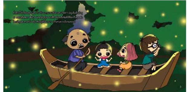
Fig. 3 Pictures in pages 2-3

8 visual images which were later applied to 1 illustrated children's book.