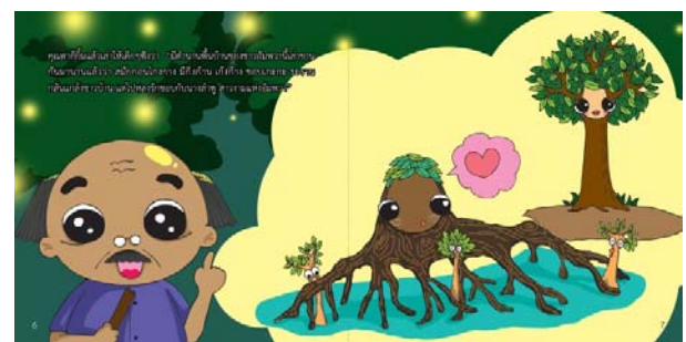
Fig. 5 Pictures in pages 6-7

“Little fireflies emitting light at night inspired imagination which led to the story of Ampawa Fireflies.”