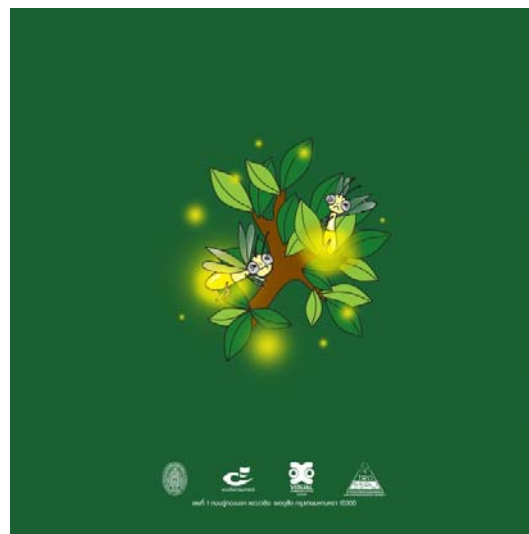
Fig. 13 The Back Cover

Kongkang: Mangroves are big trees of the height of 22-35 meters. They have a taproot with aerial roots coming out of their trunks, 3–8 meters above ground. Aerial roots grow disorderly and nearly orthogonally with the trunk and then bend orthogonally again to the ground to support the trunk. The top of the tree has the up-side down narrow cone shape.”