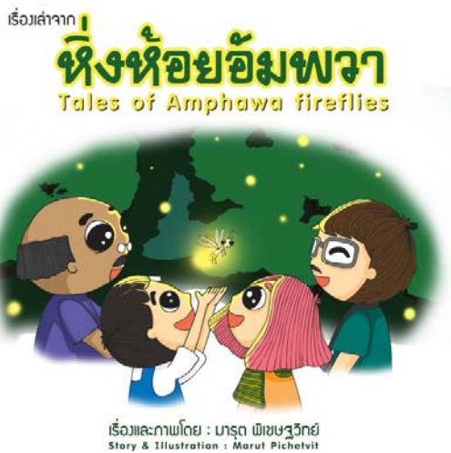
Fig 1 The front cover of the Ampawa Fireflies picture book

“Tonight, lights from fireflies are blinking like meteors over the cork trees along the Ampawa canal. Two siblings, Pang and Poon, and their daddy are cruising along the canal to see the fireflies. The old man who is paddling the boat has lived here in Ampawa for a long time.”