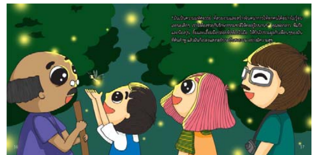
Fig. 10 Pictures in pages 16-17

“The cork tree knew what the mangrove tried to do so she grew her roots into pointed sticks on the ground around her to prevent the mangrove to come to her. The mangrove could not come to the cork tree so he found a new way.”