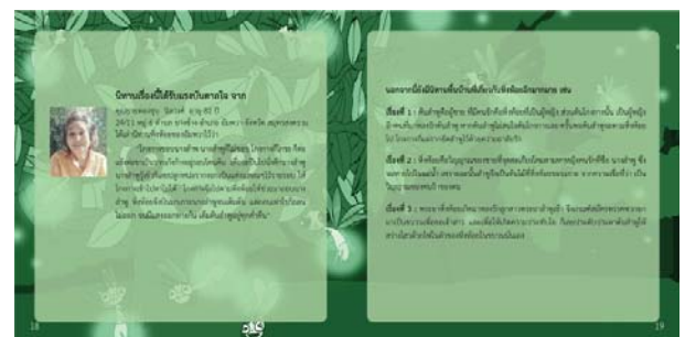
Fig. 11 Pages 18-19: Inspiration

“The mangrove asked fireflies to fetch the cork tree for him. A lot of fireflies then flocked around the cork tree and tried very hard to pull her out but still they could not pull the cork tree out because they were very small. They pulled and pulled... until lights came out of their abdomens. And they still try until today.”