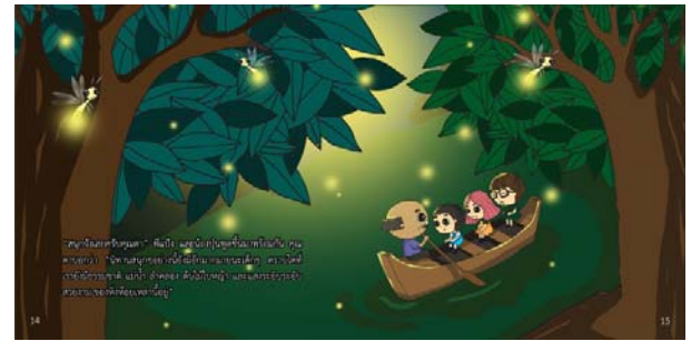
Fig. 9 Pictures in pages 14-15

“The cork tree did not love the mangrove and indifferently refused him. The mangrove got very angry so he grew his roots in an attempt to climb to sit on the lap of the cork tree. That is why mangroves have long roots coming out of their trunks to support them.” The old man says.”