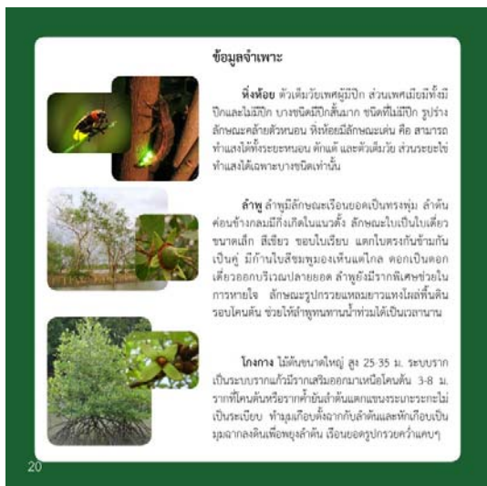
Fig. 12 Page 20: Specific Information

Tale 3: Phya Firefly fell for the daughter of Phya Lumphu (cork tree). So Phya Firefly brought his partisan fireflies over to ask for Phya Lumphu’s permission to marry his daughter. To impress Phya Lumphu, Phya Firefly decorated the cork tree with lights from the partisan fireflies