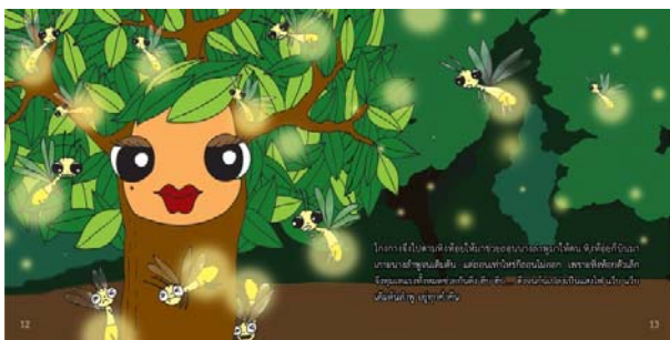
Fig. 8 Pictures in pages 12-13

“It is a beautiful wonder that can endlessly inspire imagination for everyone. Therefore, we need to protect the nature so it can stay with us for a long time”, their daddy says. Pang and Poon smile. Then Poon opens his fit and lets the firefly fly back to his friends at the cork trees. The light from the firefly is blinking beautifully.”