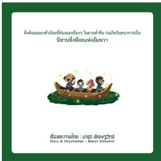
Fig. 2 Inside cover

“A little firefly comes close to Poon's face blinking light. The boy catches it with his hand. Puzzling, he asks the old man, “Why is light coming out from this insect's abdomen, Grandpa?”