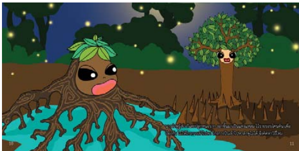
Fig. 7 Pictures in pages 10-11

“The story was fun, Grandpa. “Pang and Poon say simultaneously. The old man then says, “There are lots of fun stories like this one as long as we still have the nature – rivers, canals, trees and beautiful lights of these fireflies.”