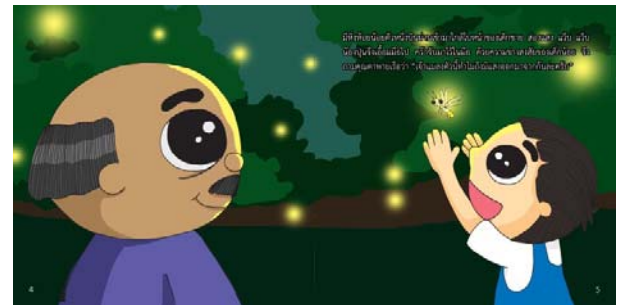
Fig. 4 Pictures in pages 4-5

“A little firefly comes close to Poon's face blinking light. The boy catches it with his hand. Puzzling, he asks the old man, “Why is light coming out from this insect's abdomen, Grandpa?”